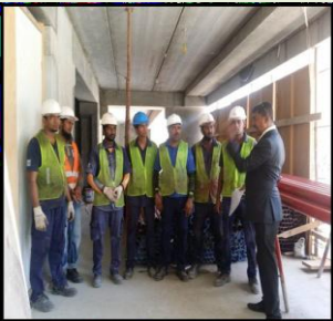
QZS - BIA Site